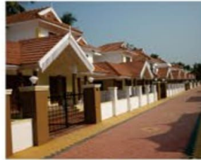
mystic winds LUXURY VILLAS TRIPUNITHURA-KOCHI