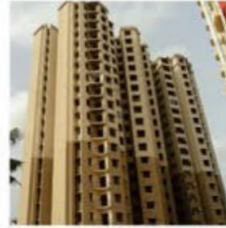
Mystic Heights III LIFE STYLE APARTMENTS VYTILA-COCHIN