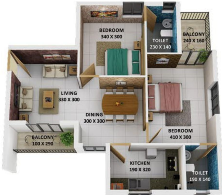
Type J 2 BHK-915 Sqft.