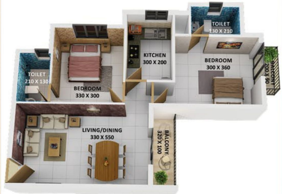
Type F 2 BHK-867 Sqft.