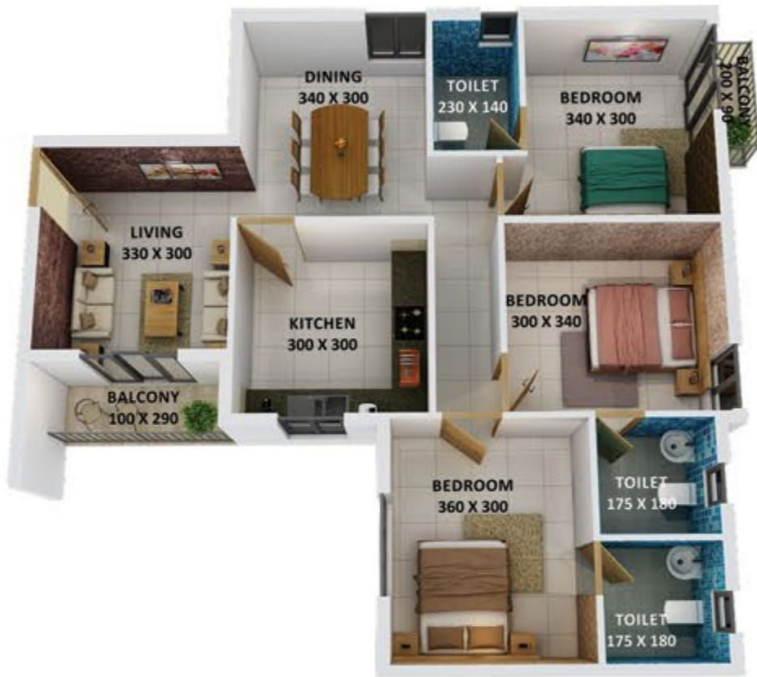
Type C 3 BHK-1200 Sqft