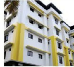
MYSTIC CHARMS KADAVANTHARA, COCHIN