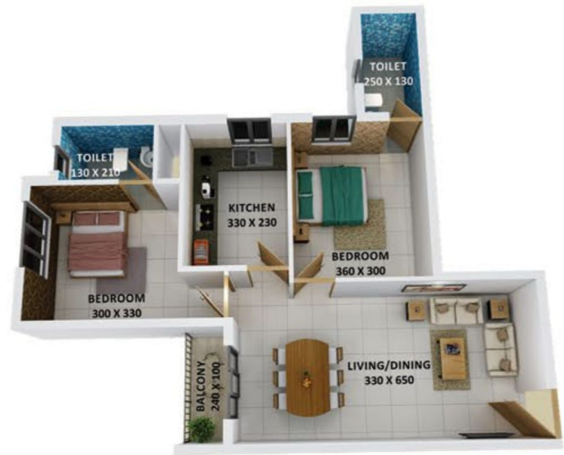
Type H 2 BHK-912 Sqft.