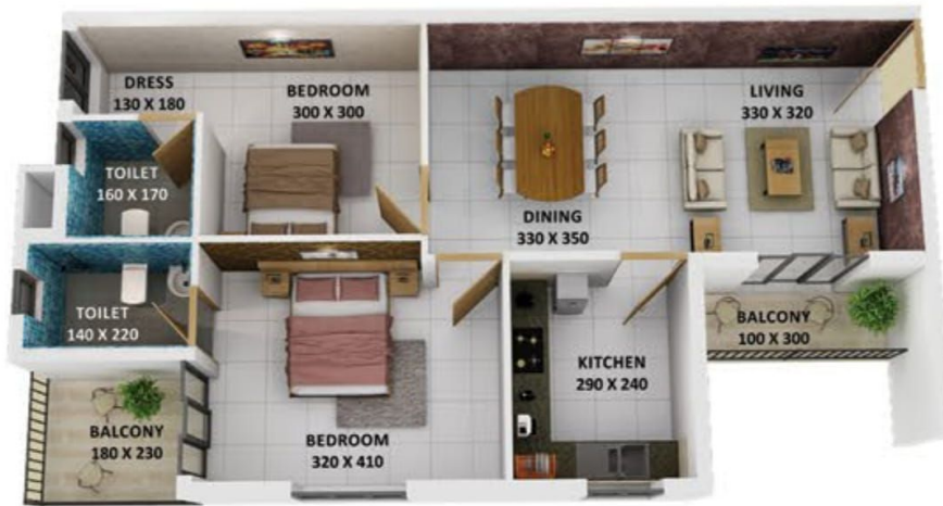
Type G 2 BHK-988 Sqft.