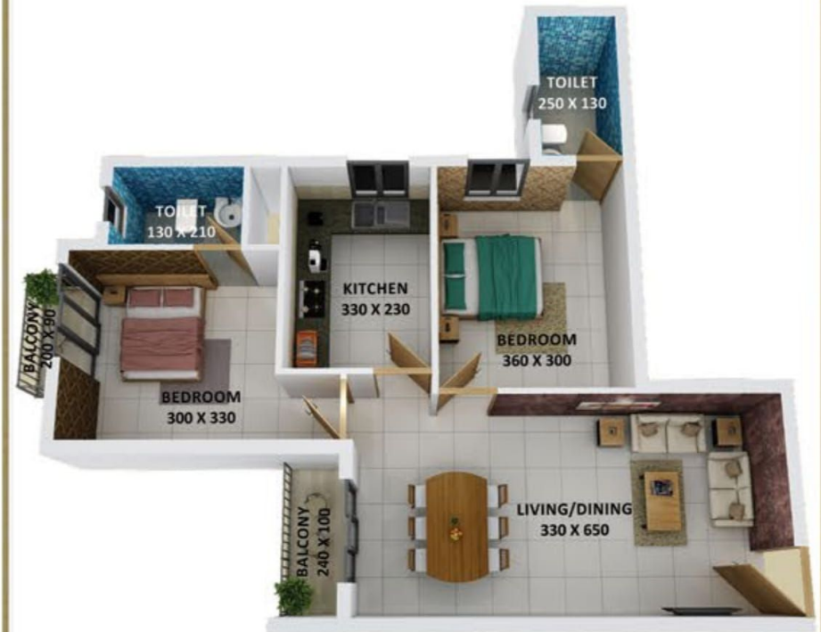
Type B 2 BHK-936 Sqft.