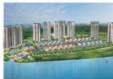
AQUA CITY the ultimate destination in cochin PERIYAR BANKS ALLUVA COCHIN