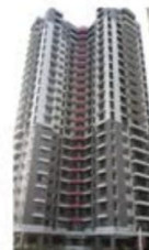
MOON WATERS sky villas PERIYAR BANKS ALLUVA COCHIN