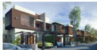
Epcot County Elegant twin villas | Cochin