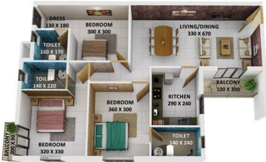
Type A 3 BHK-1195 Sqft.