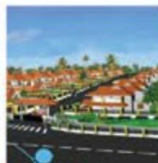
blue berry LUXURY VILLAS THURAVOOR