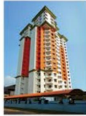
Mystic Heights I LIFE STYLE APARTMENTS VYTILA-COCHIN