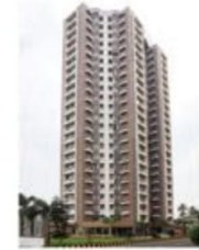
ALPINE PERIYAR BANKS ALLUVA COCHIN