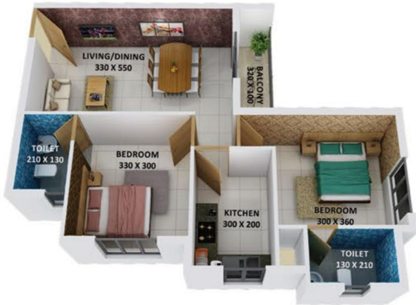
Type L 2 BHK-829 Sqft.