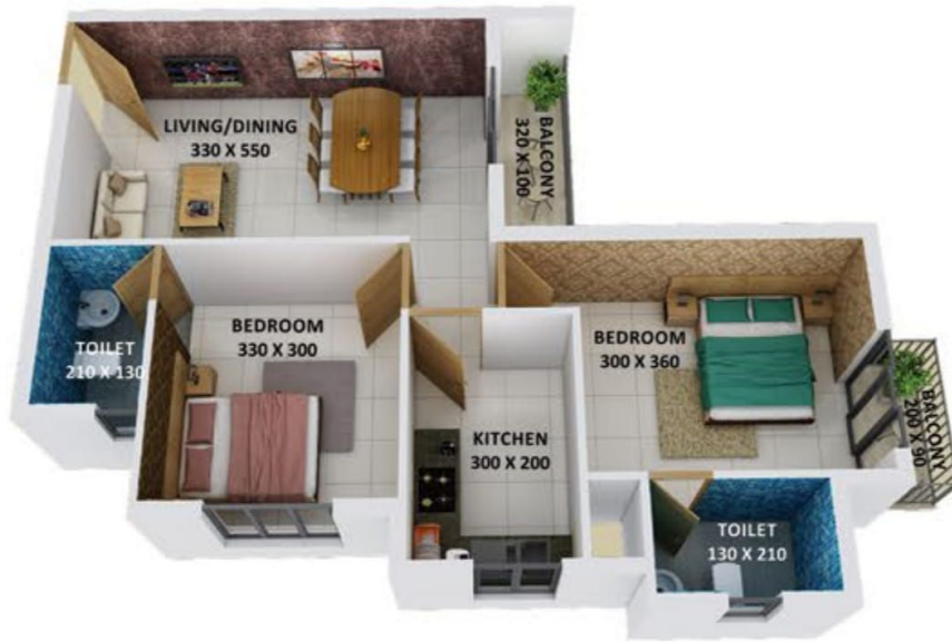
Type E 2 BHK-866 Sqft.