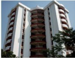
cyber Plaza MIDRANGE APARTMENTS SEWPORT AIRPORT ROAD KADAVANTHARA