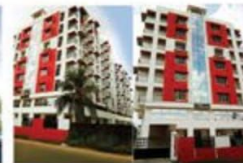
SHWAS Fortuna SHADES FOR LIFE PUTHUVANKALLI TRIPUNITHURA