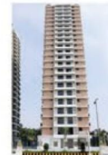
Trio Core 22 PERIYAR BANKS