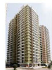
TRICORE 2 KADAVANTHARA