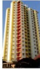
Mystic Heights II LIFE STYLE APARTMENTS VYTILA-COCHIN