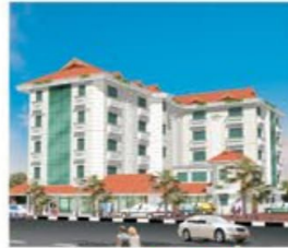
HOTEL HORIZON INTERNATIONAL GURUVAYOOR