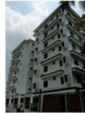
Guest House TRIPUNITHURA KOCHI