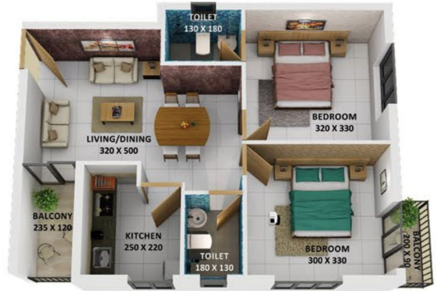
Type K 2 BHK-774 Sqft.