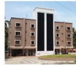
Mystic Heights IV LIFE STYLE APARTMENTS VYTILA-COCHIN