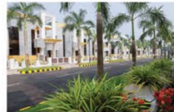
Palm Bay LUXURY VILLAS