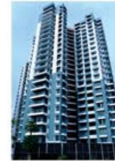
MOON WATERS sky villas PERIYAR BANKS ALLUVA COCHIN