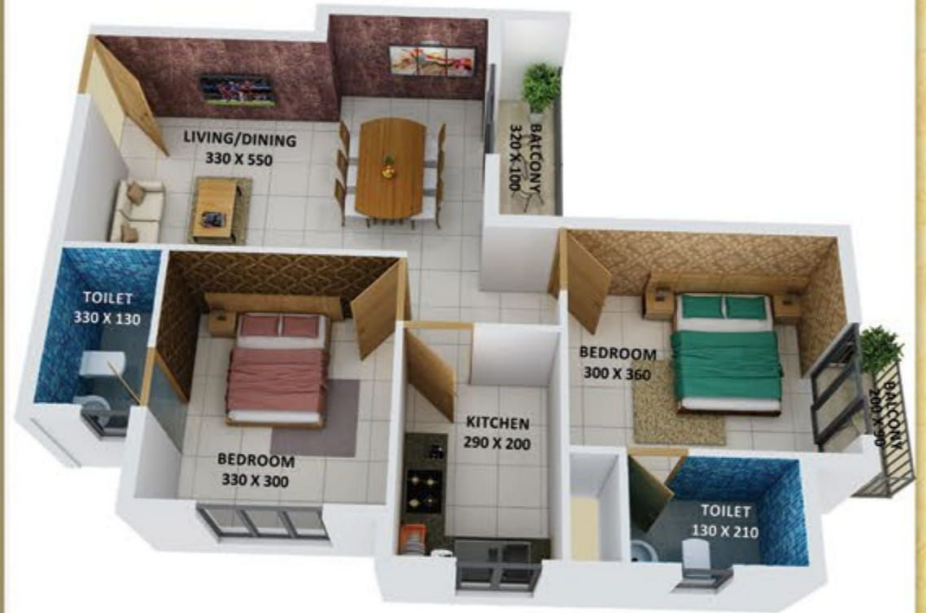
Type D 2 BHK-898 Sqft.