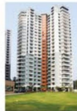
MOON WATERS sky villas PERIYAR BANKS ALLUVA COCHIN