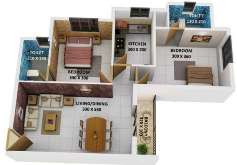
Type M 2 BHK-831 Sqft.